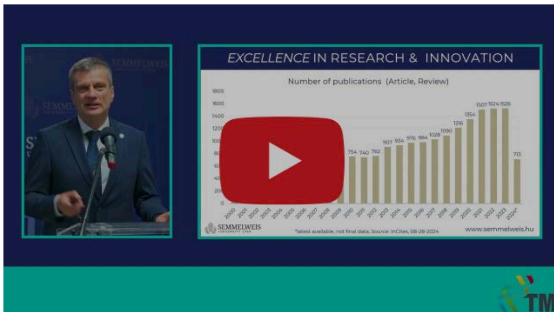
Centre for Translational Medicine, Semmelweis University Semester Opening Ceremony 2024/25

In addition, photos taken during the event are now available for viewing. You can browse through the memorable moments captured by visiting the following link: